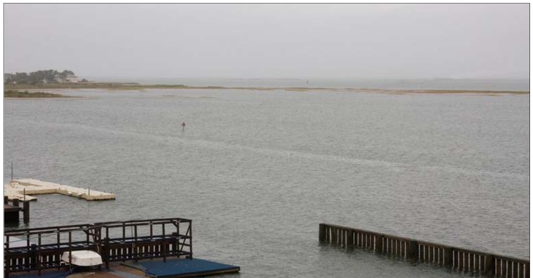
High tide on Mordecai Island looking west from Molly Allison docks, September 2008. The south end of the island is nearly submerged.

We will continue to seek funding opportunities and grant possibilities to enable us to proceed with both major efforts. We will also continue to work cooperatively with the Army Corps, NJ DEP and the government and citizens of Beach Haven as things develop.