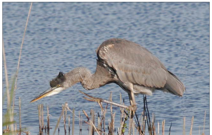
Striking Heron on Mordecai