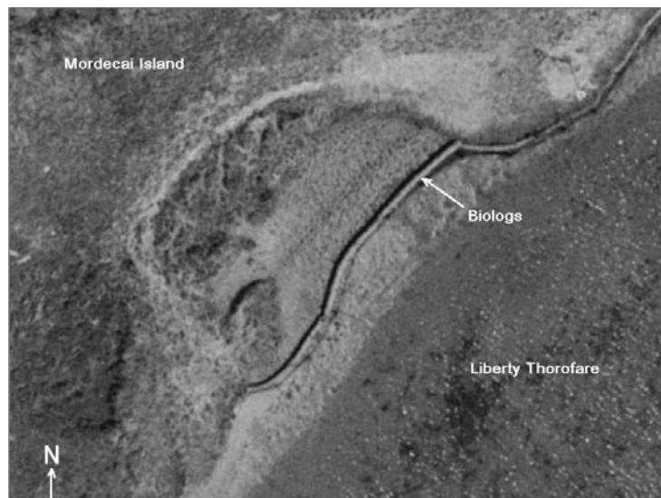
Southeastern area of installation.